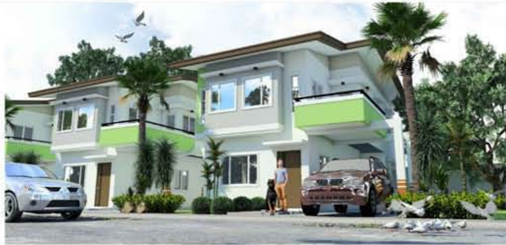
ARCHITECT'S PERSPECTIVE ONLY