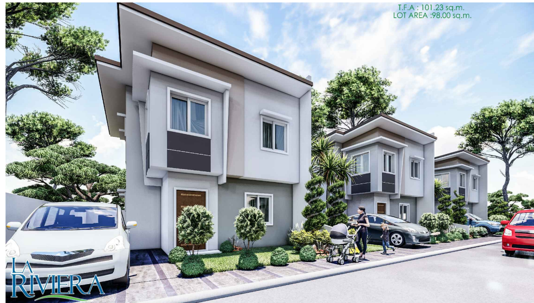
ARCHITECT'S PERSPECTIVE ONLY